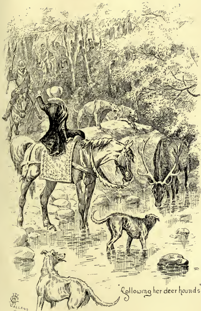
"Following her deer hounds"